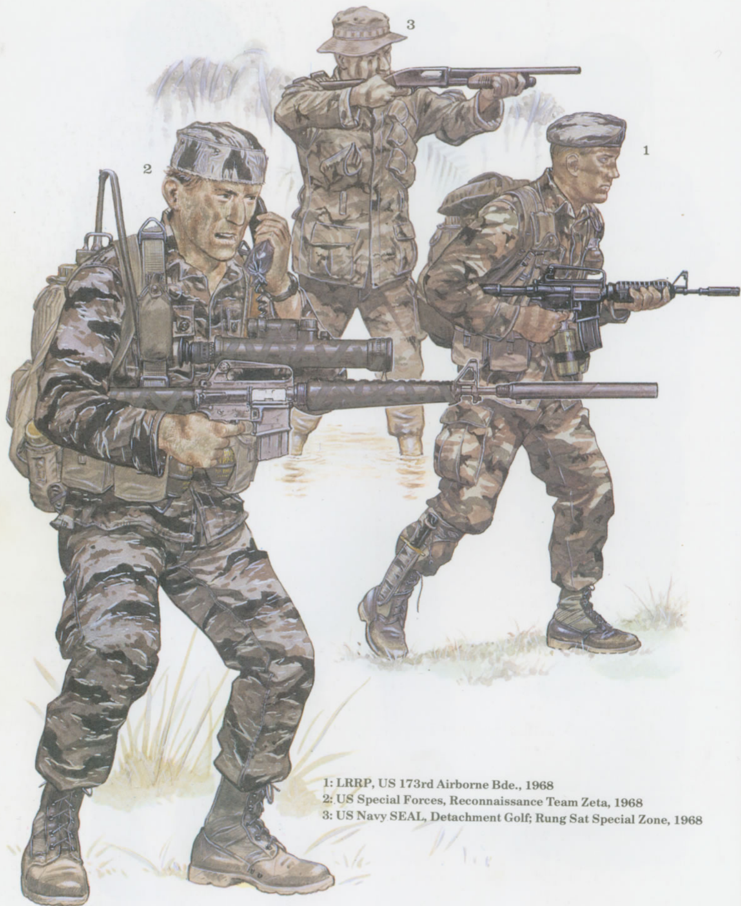
1: LRRP, US 173rd Airborne Bde., 1968 2: US Special Forces, Reconnaissance Team Zeta, 1968 3: US Navy SEAL, Detachment Golf; Rung Sat Special Zone, 1968