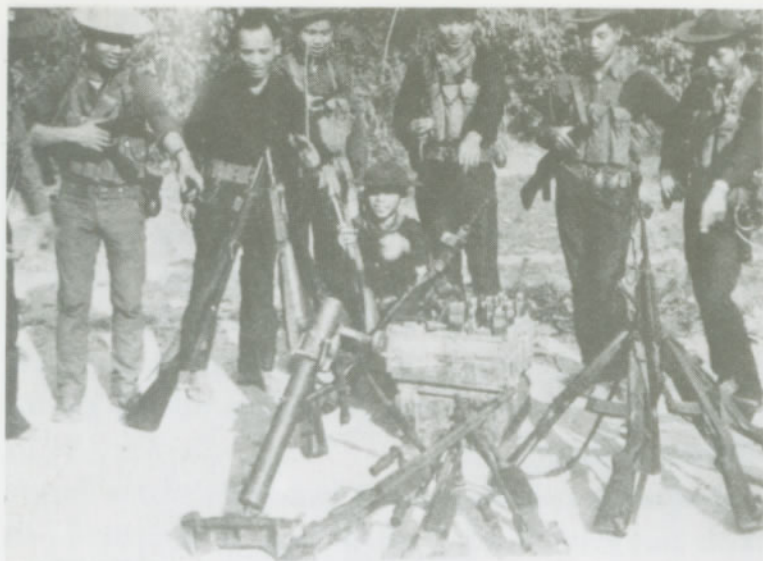
A blurred photo which repays study, of VC Main Force personnel displaying captured ARVN weapons. Most are armed with AK-47s and wear ChiCom chest pouches and US pistol belts. A mixture of black VC and khaki 'NVA Export' uniforms are worn, with bush hats; two men have parachute cloth scarfs. The date is probably the mid-1960s.

material were sewn on as camouflage. Some examples of NVA uniform caps also appeared in the South. The issue version, vaguely resembling a World War II Japanese model, was commonly worn in the North as an alternative to the sun helmet when on leave or pass. Cruder versions, similar in style to the US Marine utility cap, were sometimes seen.