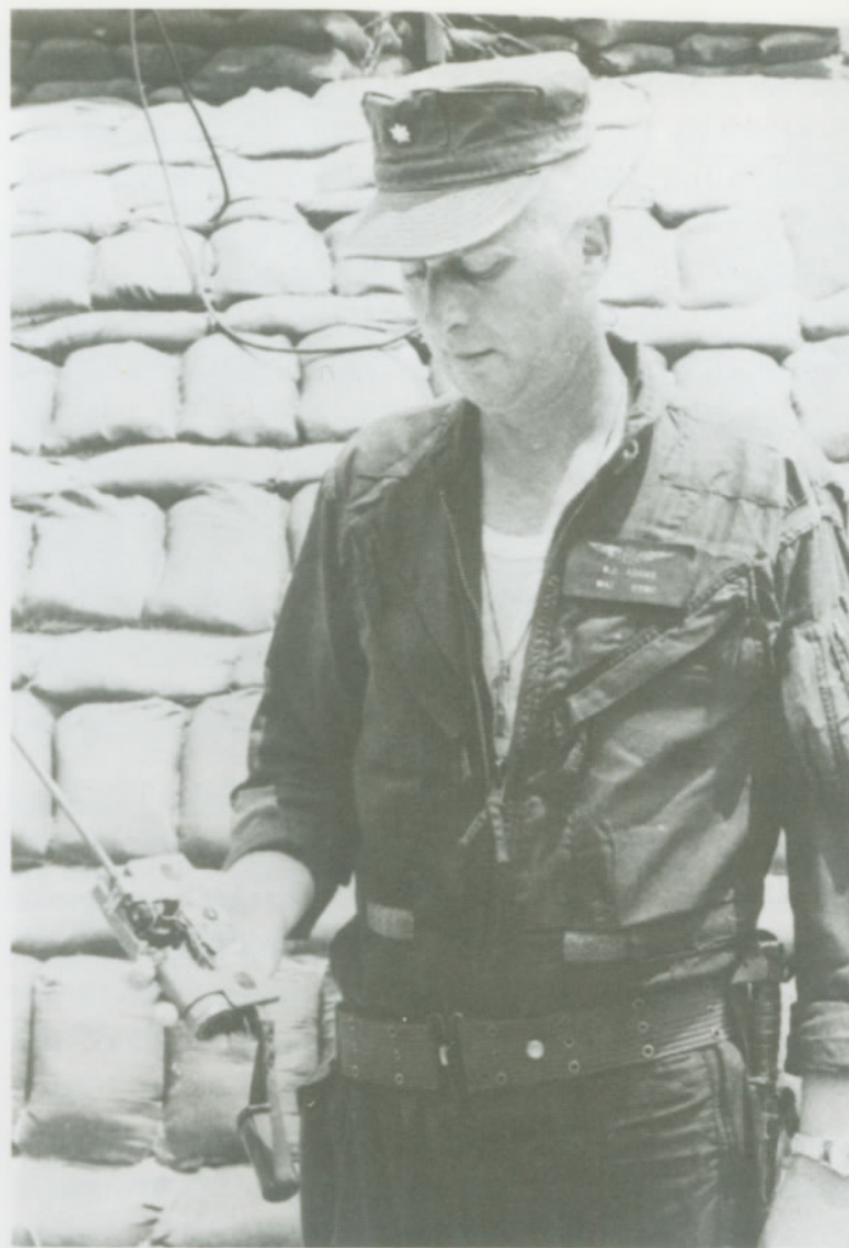
A US Marine helicopter pilot holds the remains of his survival radio, smashed by two enemy bullets during a mission in 1969. He wears the US Navy CS/FRP-1 flying suit ('Coveralls, Flying, Summer, Fire-Resistant, Polyamide') with a black leather namepatch on the left breast. This suit replaced the earlier cotton type shown in the colour plates during the mid-1960s, and was standard issue for all Navy and Marine fixed-wing and helicopter aircrew thereafter. A Marine major's oakleaf is pinned to the utility cap; personal equipment includes a .45 pistol and a Pilot's Survival Knife worn on an M1936 Pistol Belt, recognisable by its metal snap.

The field uniform of the Vietnamese Marine Corps was another example of the ubiquitous 'tiger-stripes'. The pocket style is typical of the VNMC. The shoulder patch is that of the Vietnamese Marine Corps as a whole; individual battalions were distinguished by the background colour of the nametape (for the 5th, white lettering on blue tape). Such decorations were usually omitted in the field. Formal headgear was a green beret with metal VNMC globe-and-anchor device; in the field, either a 'tiger-stripe' utility cap or 'Jones hat' was worn. The same material was also used for helmet covers, as shown. The weapon is an American M-72 LAW (Light Anti-tank Weapon), a disposable rocket launcher. The man also carries M-59