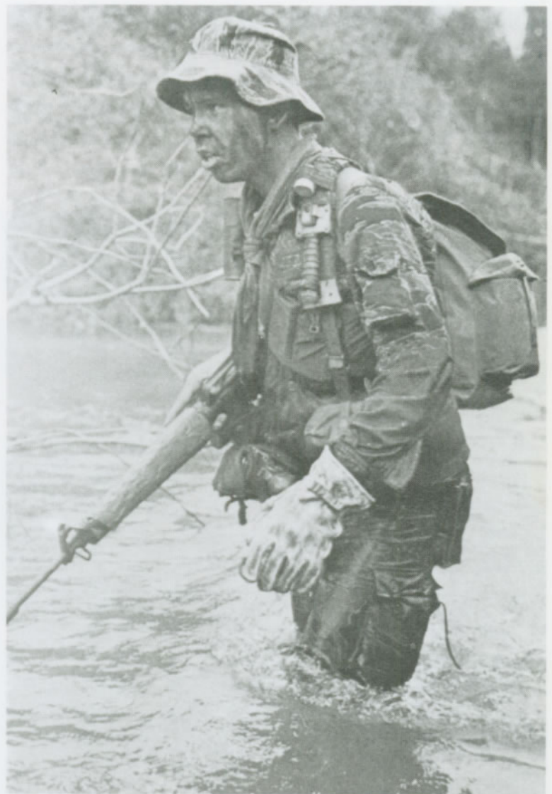
With face camouflaged, and wearing a 'tiger-stripe' uniform and 'Jones hat', a reconnaissance soldier wades a stream; even his M-16 is 'tiger-striped', apparently with paint. He is a member of the Aerorifle Platoon (ARP), 2/17 Cavalry, 101st Airborne Division: ARPs undertook short-range reconnaissance, evaluated air strikes, and provided security for downed aircraft. He is festooned with cotton bandoliers and grenades. A Pilot's Survival Knife is taped to his harness, and above it an empty film can, probably to hold matches. The knife is a poor choice of weapon, due to its short blade and sawtooth back. A field dressing pocket has been sewn to the left sleeve of the jacket; and note the yellow chamois leather work glove, a fairly common item. The rucksack is the ARVN two-pocket model.

Readers who desire more information are referred to the select bibliography at the end, which includes works on the conflict itself as well as its uniforms. Material on other Allied armies, and on other units of the US forces, will be found in MAA 104, Armies of the Vietnam War 1962-75 .