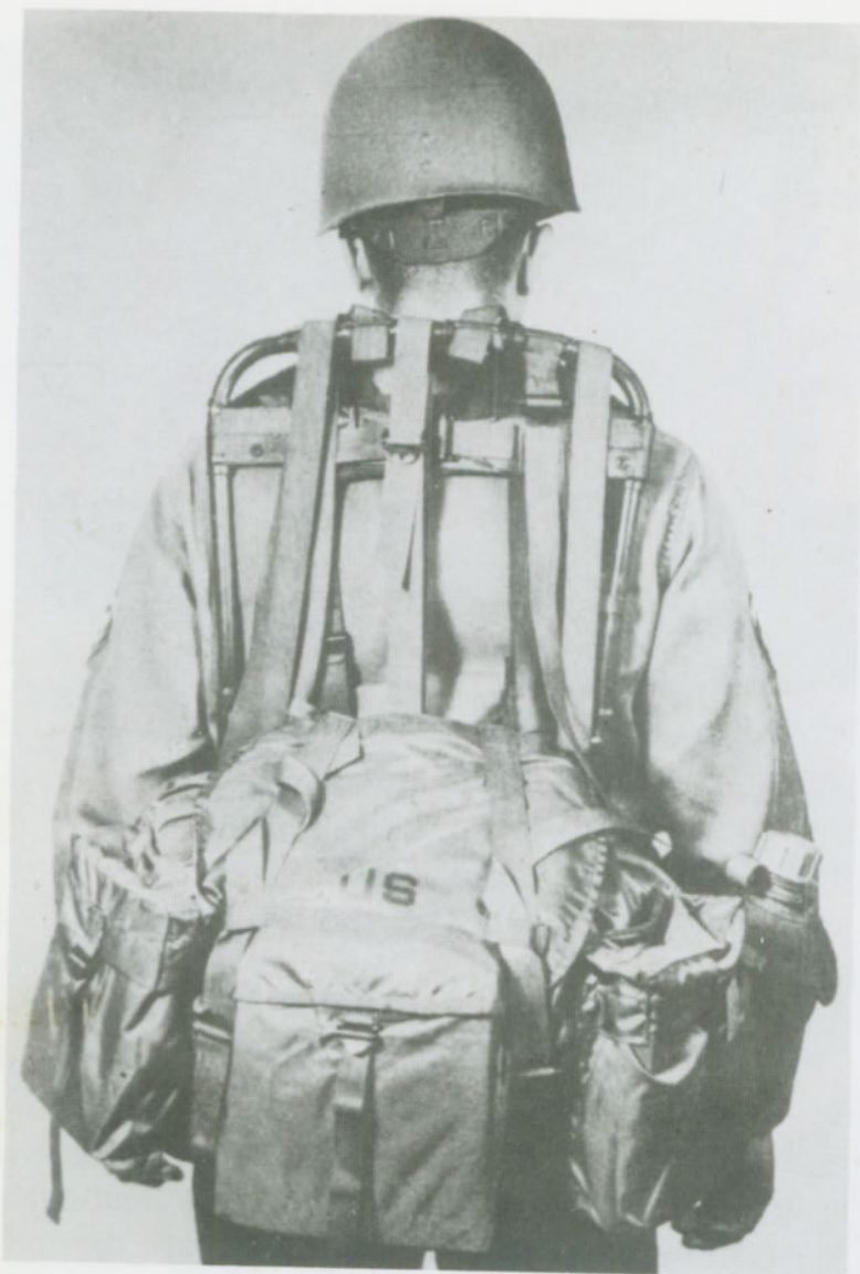
Lightweight Tropical Rucksack with frame. This consists of a central compartment with drawstring closure, and one large and two small external pockets. The inside of the main compartment flap incorporates a space for stowing maps and papers. Equipment hangers—web loops and webbing with eyelets—appear at the sides of the pack and just above the pockets, though the latter are hidden here by the main flap. The side pockets have a ‘tunnel’ between their rear face and the side of the main pack, so that items such as machetes can be slipped behind the pockets and attached to the hanger above. The whole pack is made of heavy nylon, and can be strapped to either the top or the bottom of the aluminium tube frame.

five-round stripper clips of 7.62 Nagant (a totally different round from that used with the AK and SKS). The compartments were closed by ties rather than toggles.