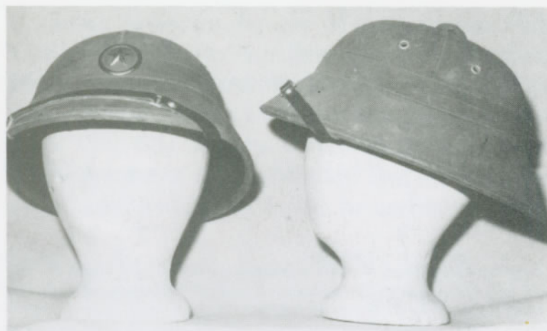
The NVA sun helmet.

The NVA considered the RPG launcher a crew-served weapon and issued it to three-man teams. This man is the actual gunner. In addition to his RPG-2, he carries an SKS rifle (his two assistants would have AK-47s.) In place of a sun helmet he wears the alternative NVA bush hat. His trousers are gathered at the ankles by a loop-and-button arrangement. The rocket pack is a jungle workshop item, with provision for four RPG rounds and their booster charges on the flap, and spare clothing, etc., within. The standard ChiCom rocket pack was also used, but most RPG teams simply carried their rockets in bags or baskets, or stuffed them 'pointy-