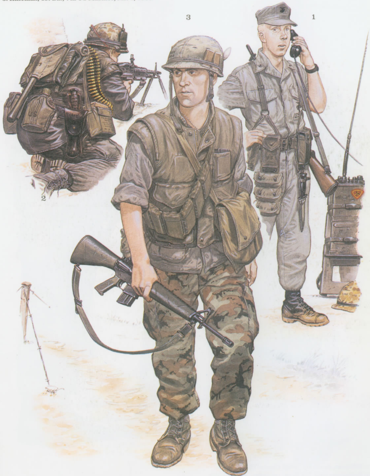
1: Lance-Corporal RTO, US 3rd Marine Div., 1965 2: Machine gunner, US Marines; Hue City, Tet 1968 3: Rifleman, 1st Bn., 7th US Marines; MR 1, 1969