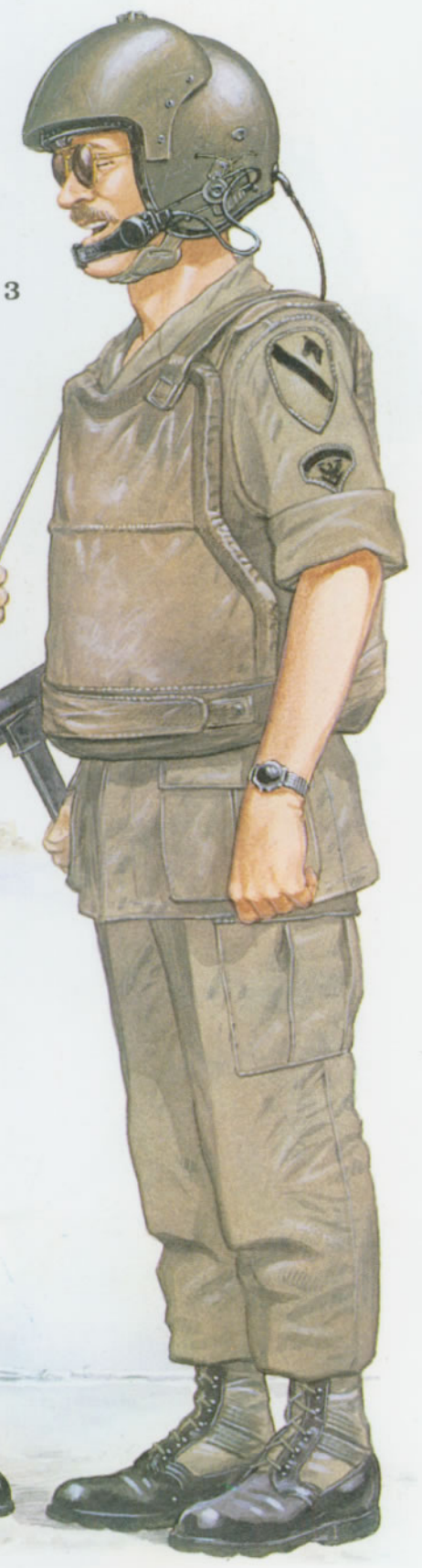
1: Rifleman, Recce Bn., ROK Capital Div., 1966 2: Helicopter pilot, US Army 1st Aviation Bde., 1970 3: Helicopter crewman, US 1st Air Cavalry Div., 1968