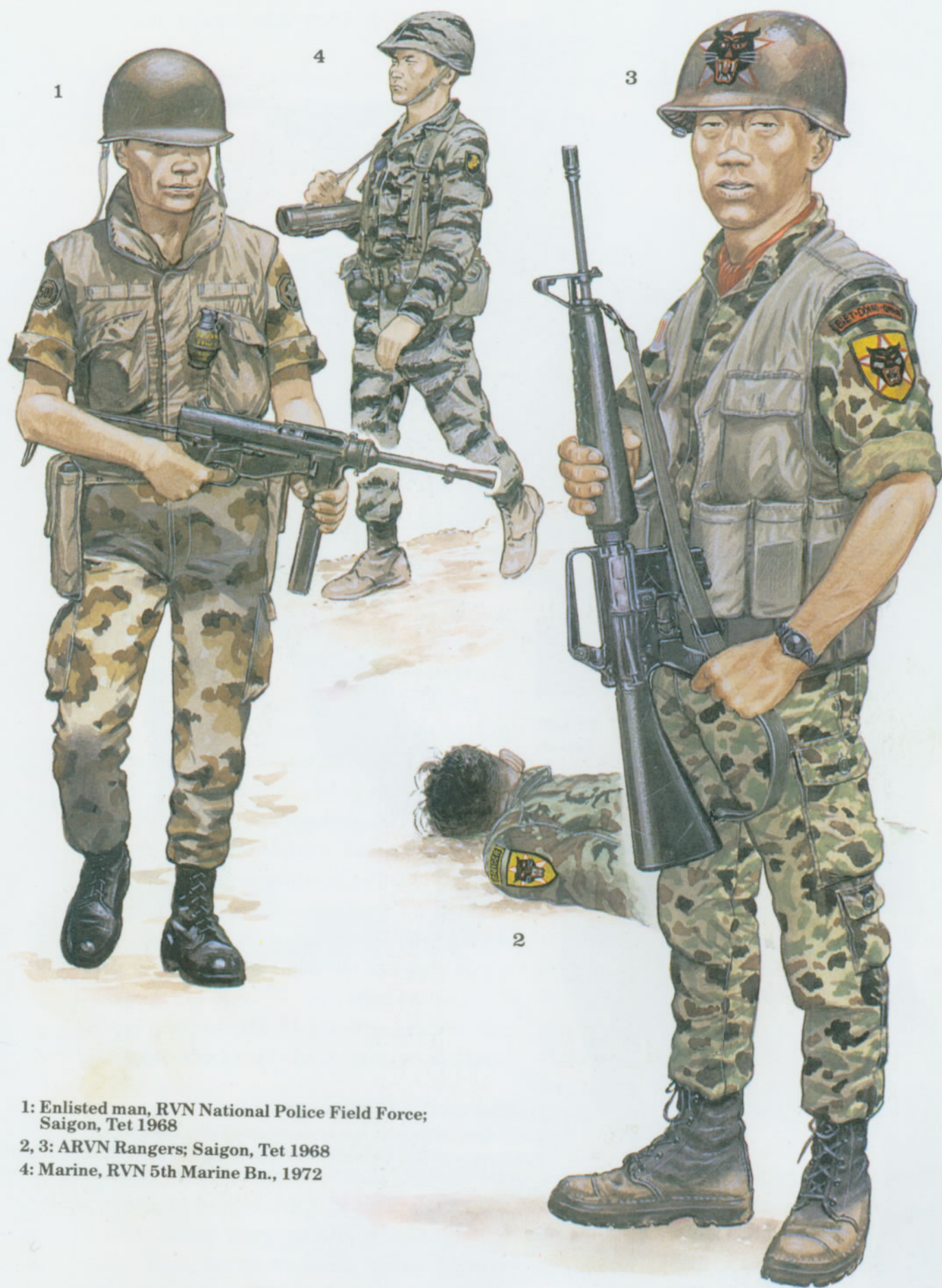
1: Enlisted man, RVN National Police Field Force; Saigon, Tet 1968 2, 3: ARVN Rangers; Saigon, Tet 1968 4: Marine, RVN 5th Marine Bn., 1972