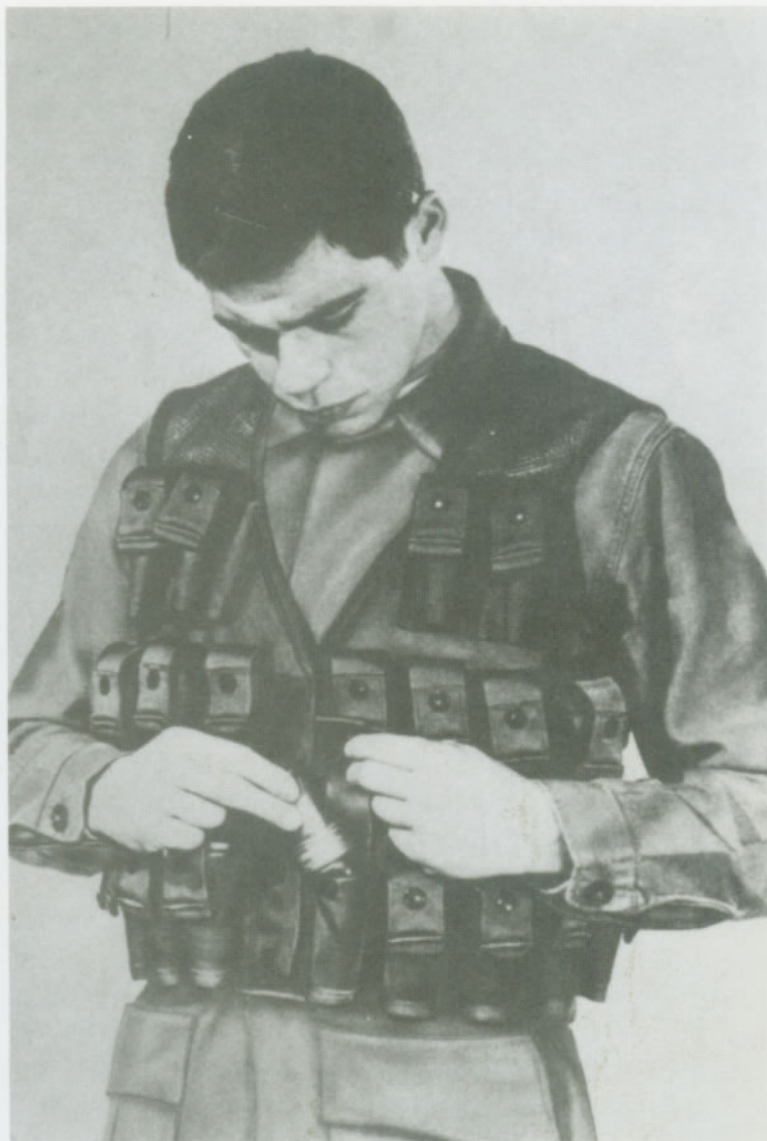
The US M-79 Grenade Carrier Vest, introduced in 1969.

Despite popular belief, comparatively few of the American advisors to the ARVN were from the Special Forces. Most were ordinary officers and enlisted men. This Army captain, taken from a photograph, is advisor to an ARVN Armored Cavalry unit, its M113 APCs deployed behind him in the rice paddies. He wears the OG 107 Cotton