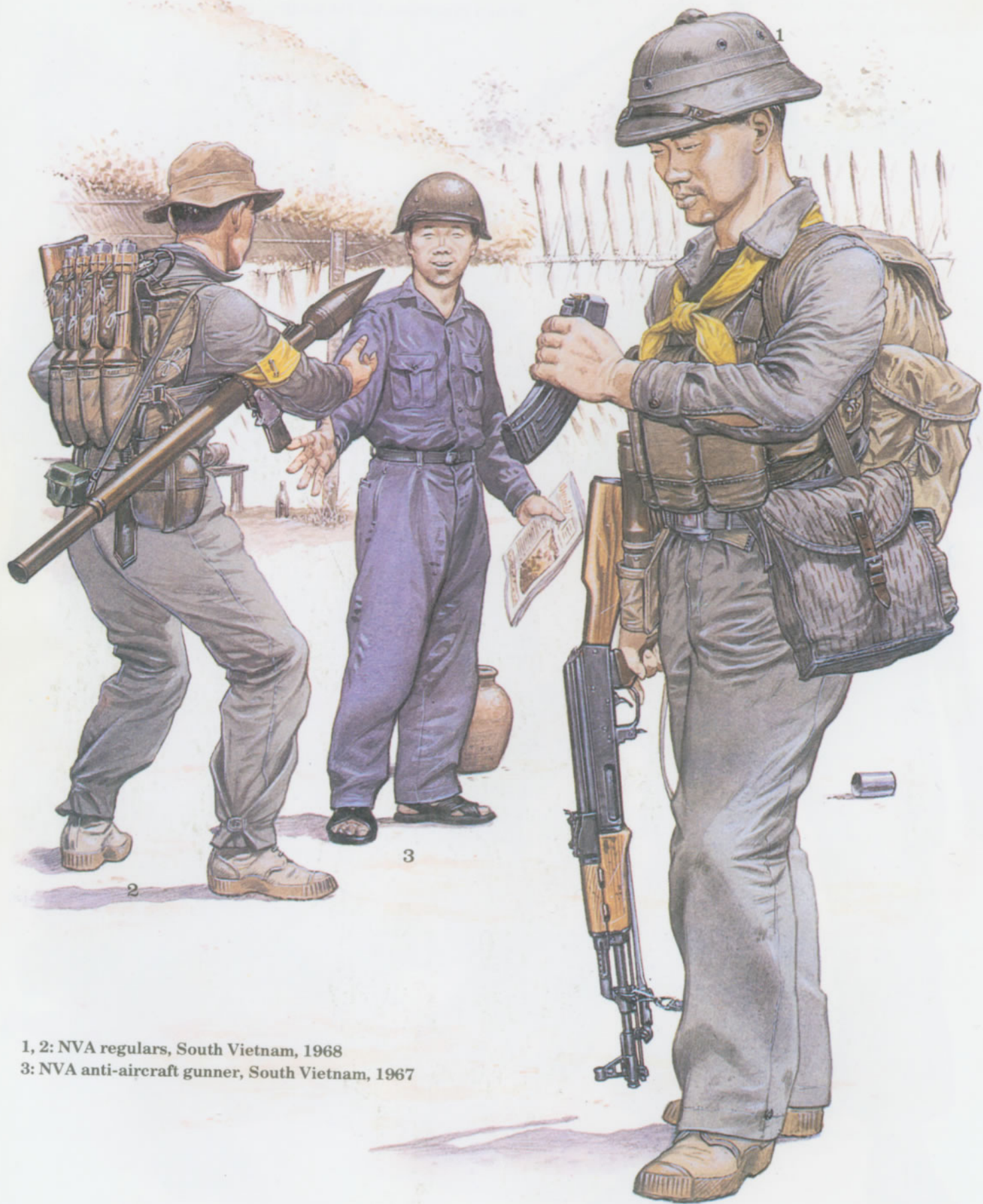
1, 2: NVA regulars, South Vietnam, 1968 3: NVA anti-aircraft gunner, South Vietnam, 1967