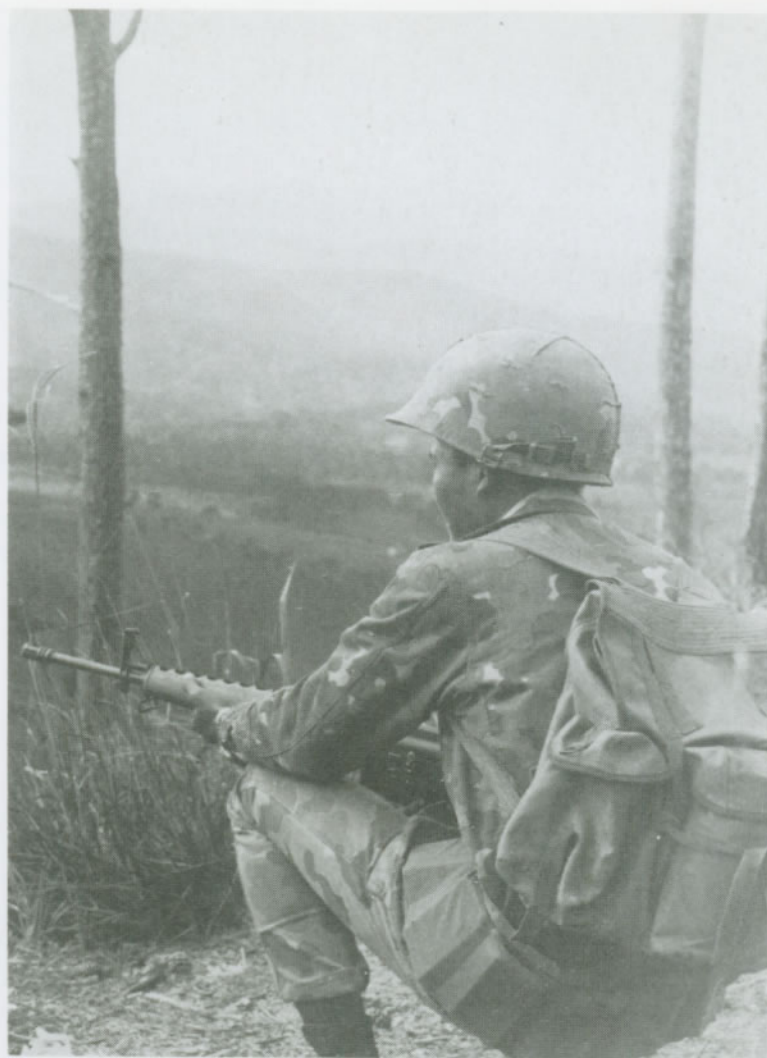
A student taking part in a National Police Field Force training class in August 1970 wears tightly-tailored 'leopard' camouflage fatigues, cotton magazine bandoliers and an ARVN three-pocket rucksack. His US helmet cover is worn 'brown side out', the colours and pattern coincidentally matching those of the uniform. (US Army)

A class in extraction techniques conducted by men of the US Army's 283rd Helicopter Detachment in 1969. They wear two-piece Nomex flight suits and locally-made 'baseball' caps, with full-colour embroidered insignia to personal taste; the man second from left has full-colour Aviator's wings and unit title. The left hand man wears the unit patch on his pocket, and a locally-made ('beercan') metal crest version on his cap. The subdued patch of 44th Medical Bde. worn on the right shoulder indicates a previous combat tour with that unit. He wears the .38 revolver issued to aircrew, in a locally-made black leather holster. The ARVN troops wear leaf-pattern utilities, and the shoulder title worn by the right hand man identifies 2nd Ranger Group. ARVN officers in the background can just be seen to wear ranking in different positions, either on the shirt front or the collar points. (US Army)