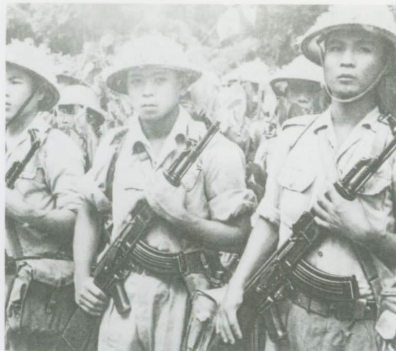
A much-reprinted photo of VC Main Force troops in about 1964. They wear tan-khaki uniforms, and Chinese-made sun helmets with foliage netting—a cloth cover was far more common. Their AK magazines are carried in the early five-pocket shoulder bag.

At this stage of the war personal equipment was minimal, and here comprises M1956 Pistol Belt, Suspenders, Universal Pouch and Canteen. The CIDG tended to have M1956 equipment, while the ARVN itself had the older World War II/Korean War type. The M-2 carbine carried by this man was extremely popular among Oriental soldiers, due to its small size, light weight and fully automatic capability. Vietnamese-made copies of the French