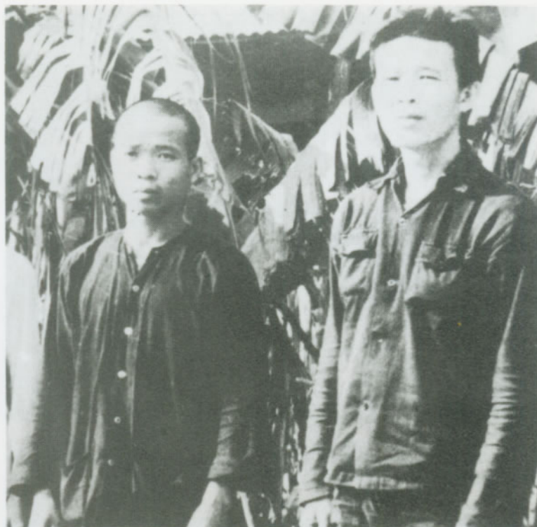
Two Viet Cong prisoners taken by the 101st Airborne Div. in 1966 display the two main types of 'black pyjama' shirts: the collarless civilian type (left) and the VC uniform type (right).

This linh tron (rifleman) wears the NVA 'export' khaki uniform and bush hat. Accoutrements comprise a ChiCom chest pouch rig for the SKS, NVA equipment belt, ChiCom two-pocket grenade pouch, a first-aid (or medical) pouch and a Chinese canteen in a canvas carrier. His NVA rucksack is camouflaged by means of branches inserted through a ring device (see Plate D2). Ho Chi Minh sandals are worn. A ChiCom Type 56 rifle is carried, distinguished by the characteristic spike bayonet. The stick-type fragmentation grenades are also of Chinese origin.