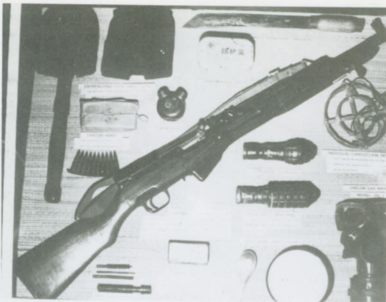
Miscellaneous clothing, equipment and personal effects of the NVA soldier.