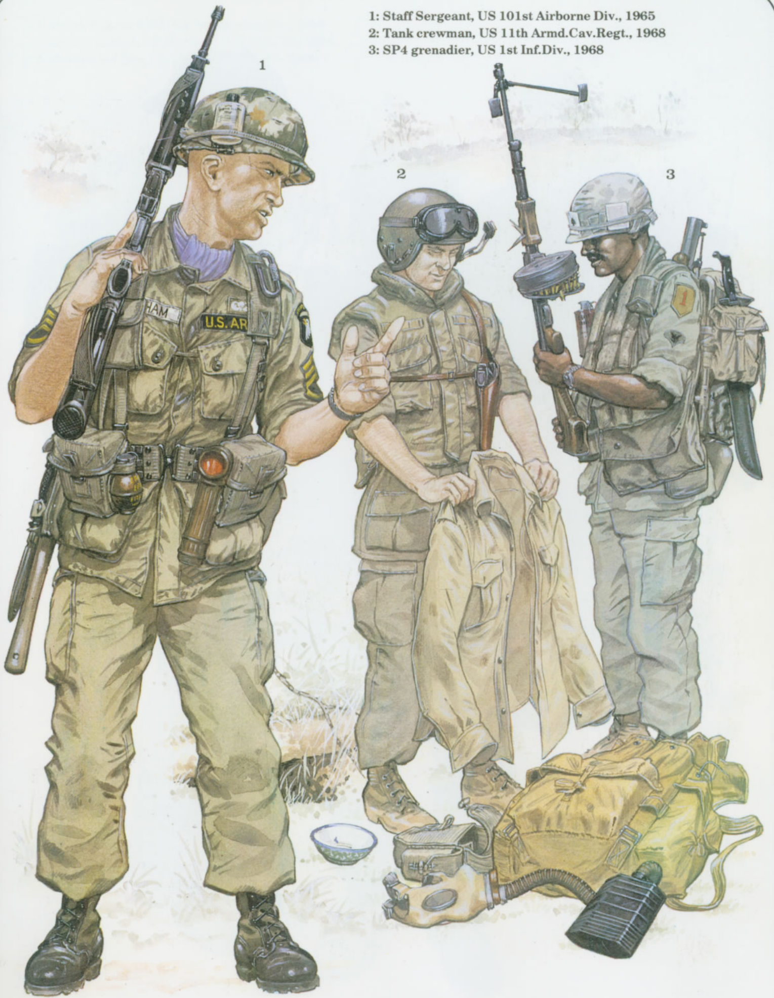
1: Staff Sergeant, US 101st Airborne Div., 1965 2: Tank crewman, US 11th Armd.Cav.Reg., 1968 3: SP4 grenadier, US 1st Inf.Div., 1968