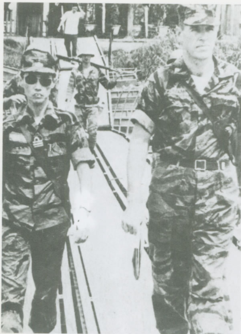
Accompanied by his Vietnamese counterpart, a USMC captain sets about his advisory duties with the 2nd VNMC Bn. at Can Duoc, 35 miles south of Saigon, in late 1964. Both officers wear 'tiger-stripe' uniform with the single-button shirt pockets characteristic of the VNMC, and utility caps, and both carry.45 pistols in shoulder holsters. The US officer has pin-on captain's bars on both collar points, and a USMC frame buckle on a black Army web belt. The VNMC major wears his naval-style rank insignia attached to a shirt button, French fashion, and a smaller version is sewn to his cap. Nametapes are in battalion colour.

but since the weapon was belt-fed its ammunition was usually carried wrapped around the body, bandolier-style. When you needed the gun, there was no time to start unpacking its belt! M-14 ammunition was normally carried only in magazines, but was issued in stripper clips.