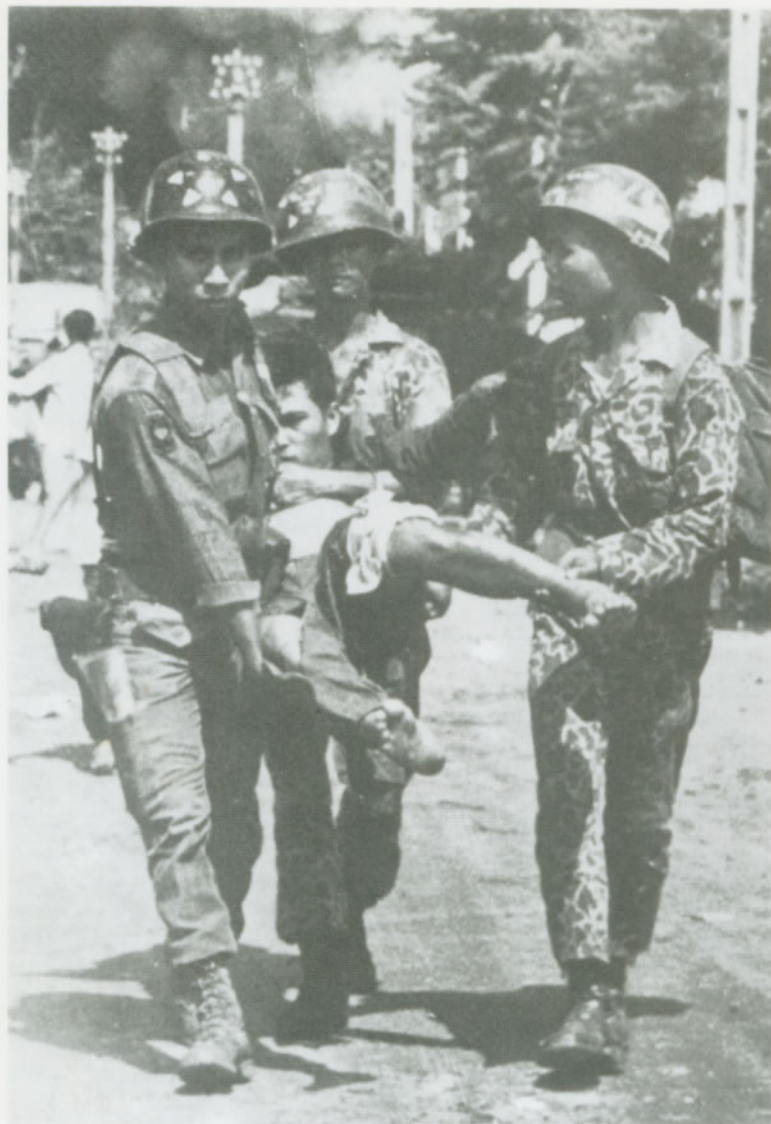
ARVN Rangers of either the 30th or the 38th Bn. carry a wounded prisoner to safety during the Saigon street fighting of Tet 1968. The left hand man wears OG 107 fatigues, and on his right shoulder the patch of the US 199th Light Inf. Bde., indicating past service with them in some capacity. The other two Rangers wear 'duck hunter' fatigues. Note Ranger star-and-panther insignia painted on helmets.

olive green twill with a stiffened front, came with the globe and anchor stencilled at the front. Footwear, since the early 1960s, was the standard black leather combat boot used by all the other services. One distinguishing feature of the Marine combat uniform was a tan-khaki web belt with a brass frame buckle (black when issued but usually worn to bare metal in service).