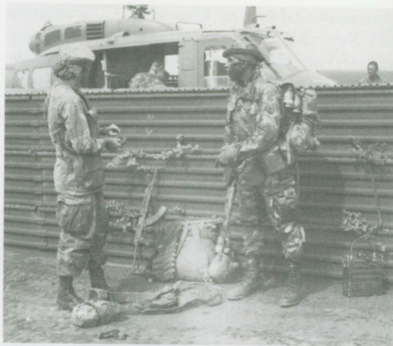
1/9 Cavalry reconnaissance troopers, November 1970. The left hand man wears a 'tiger-stripe' beret over a camouflage bandage worn as a headscarf, and a ChiCom chest pouch for his captured folding-stock AK-47. Piled at their feet are a Lightweight Rucksack, a mesh M-79 Grenadier's Vest, and an AN/PRC-25 radio awaiting insertion into a rucksack. The aircraft shelter is made of PSP, a universal engineering material in Vietnam.

Unlike some other armies, the Republic of Korea provided uniforms and equipment for its Vietnam contingent. This man wears a Korean-made camouflage suit, originally procured by the ROK Marine Corps, but also used by the Army and Special Forces. Its style is a simplified version of the USMC utilities shown in Plate E1. Korean-made combat boots are worn, although the ROK forces were quick to obtain US and ARVN jungle boots. The helmet is the World War II version of the M-1; its liner has its own leather chinstrap, in addition to the canvas strap of the helmet shell. Black electrical tape holds the ROK camouflage cover in place. Regulations for wear of the divisional shoulder patch were vague and placement could follow US or ARVN practice. Personal equipment is the US Korean War pattern, with M1945 Combat Pack and Suspenders, OD Plastic Canteen in M1910 Carrier, and the M1936 Cartridge Belt issued to