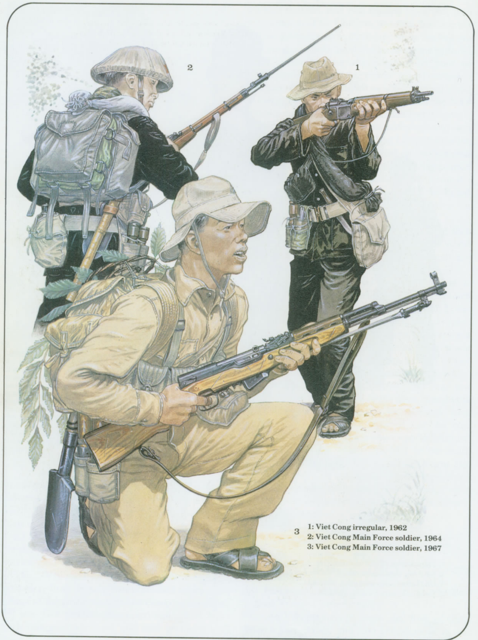
1: Viet Cong irregular, 1962 2: Viet Cong Main Force soldier, 1964 3: Viet Cong Main Force soldier, 1967