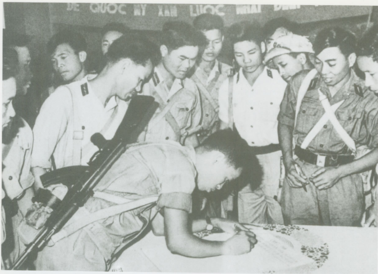
NVA soldiers sign a petition of support, in about 1965. Most have khaki uniforms, but some wear the white dress shirt seen only in the North. The man with the slung AK-47 wears the rare NVA shirt with a battledress-style waistband, sometimes called the 'NVA Combat Jacket' by Americans. Sam Browne belts without cross straps identify the two right hand men as officers; and note use of collar tabs by the officers, NCOs and enlisted men in this photo—see chart on a later page.

Starting in the early 1960s, with the deepening of the National Emergency, the fatigue uniform was also worn as service dress. Originally issued just to the Army, this uniform was eventually used by virtually every branch of military and paramilitary forces.